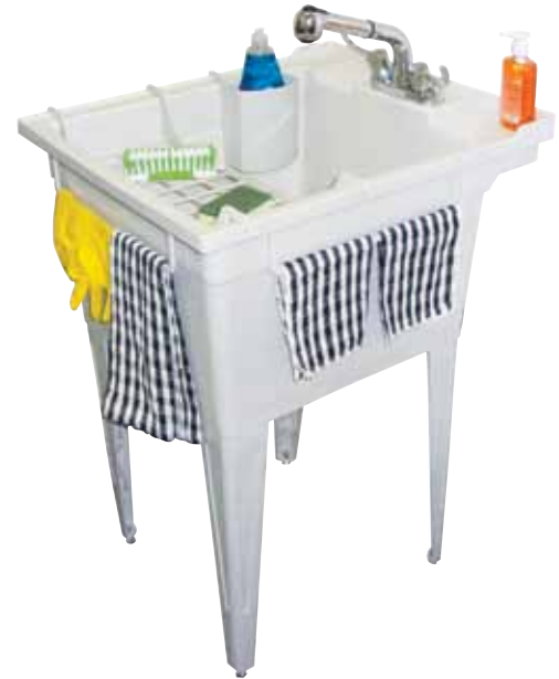
SM-19-FC model shown